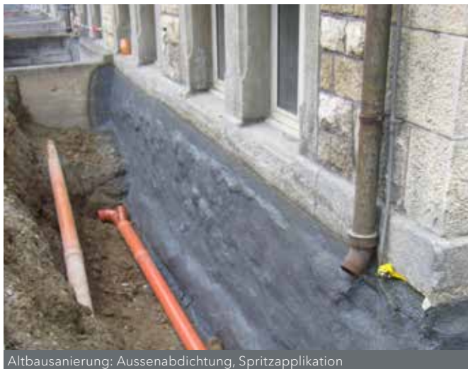
Altbausanierung: Aussenabdichtung, Spritzapplikation