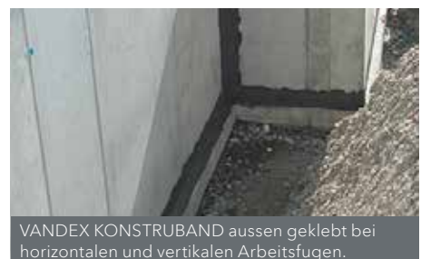
VANDEX KONSTRUBAND aussen geklebt bei horizontalen und vertikalen Arbeitsfugen.

Die Trockenkomponente besteht im Wesentlichen aus Zement, Quarz sowie chemischen Zusätzen. Durch Einmischen der Polymerkomponente entsteht nach dem Durchtrocknen eine wasserdichte, elastifizierte Schicht. Sie lässt sich auf horizontale und vertikale Flächen von Hand oder mittels eines Feinmörtelspritzgerät auftragen und ist nach der Verfestigung widerstandsfähig gegen wässrige Medien.