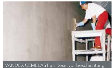
VANDEX CEMELAST als Reservoirbeschichtung