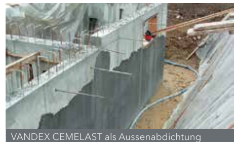
VANDEX CEMELAST als Aussenabdichtung

VANDEX CEMELAST ist eine zementgebundene, elastifizierte, 2-komponentige Dichtungsschlämme bestehend aus VANDEX BB 75 (Trockenkomponente) und VANDEX CEMELAST LIQUID (Anmachflüssigkeit). VANDEX CEMELAST wird auf Beton, Mauerwerk und Putz zur Abdichtung gegen Wasser und Feuchtigkeit angewendet, in Kombination mit VANDEX KONSTRUBAND auch für Arbeitsfugen geeignet. VANDEX CEMELAST ist geeignet für rissgefährdete Zonen sowie für den Einsatz im Trinkwasserbereich.